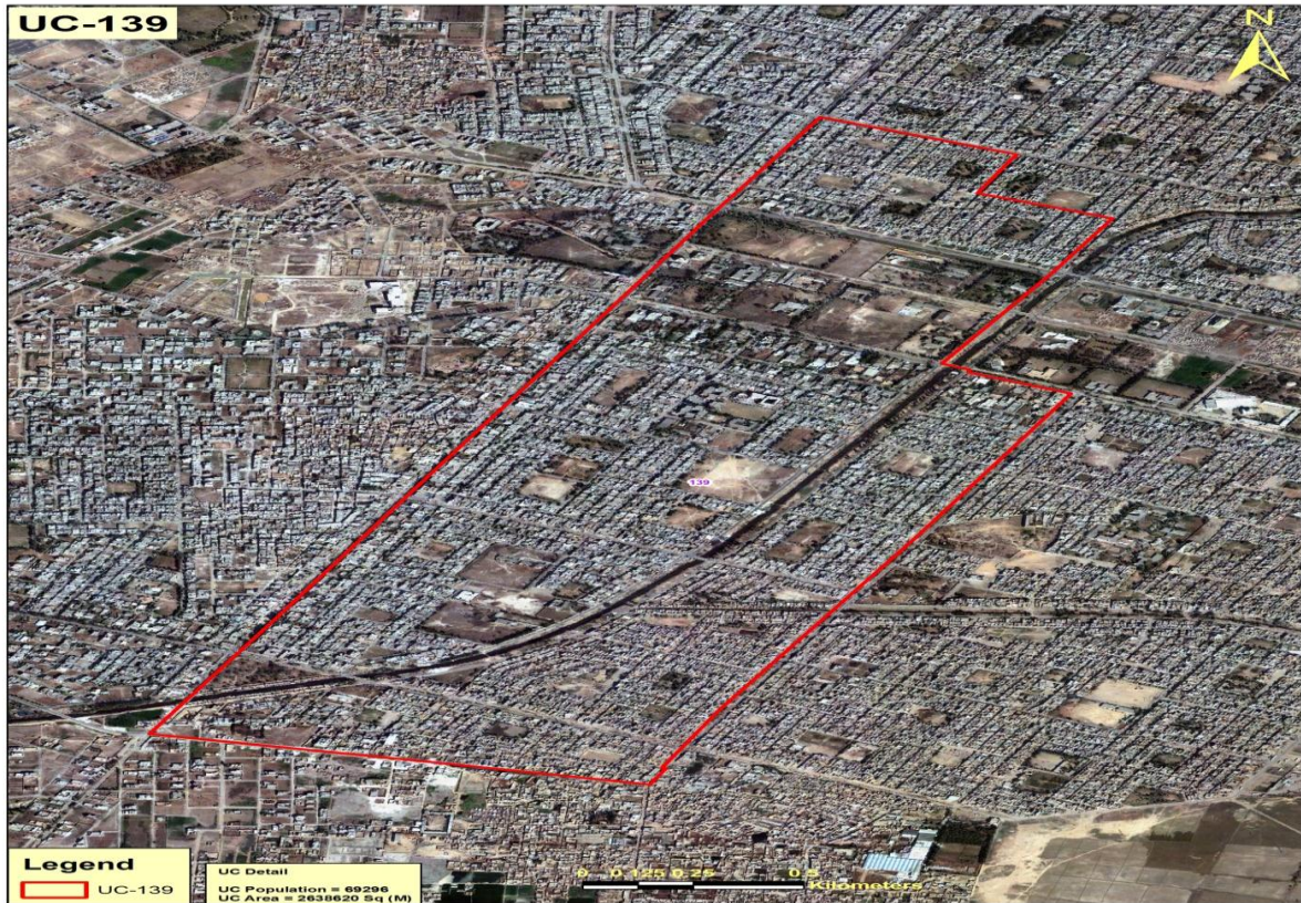
Figure 1: Map of UC 139 Green Town

Union Council – 139 (Green Town) is located in Nishtar Town. Total area of the UC is 2638620 m 2 with population of 69296. This area is predominantly middle income area with planned settlement.